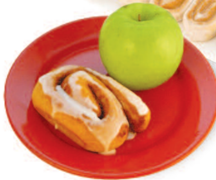
Honey Wheat Cinnamon Rolls