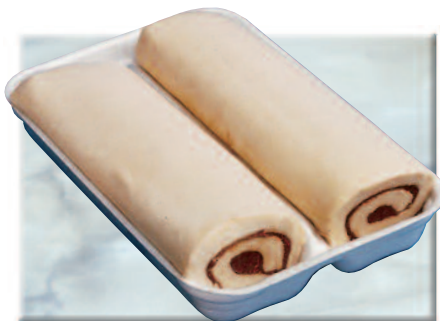
Cinnamon Rolls Dough Log