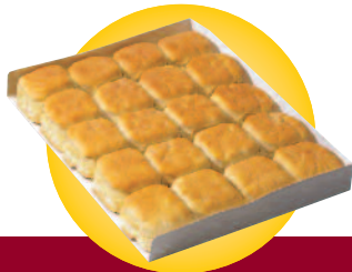
"Old South" Fully Baked Buttermilk Biscuits

Insist on the brand that has served America's foodservice establishments for almost 40 years!