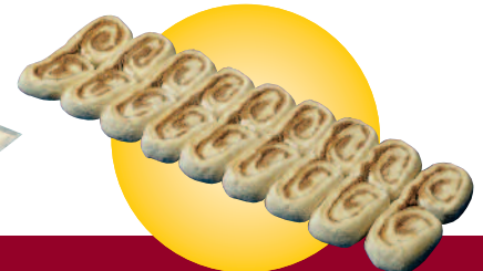
Gourmet Cinnamon Roll Doughs