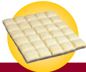
Layer Pack Roll Doughs