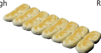
Cheese Rolls Dough