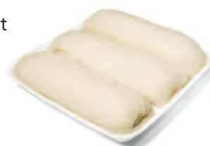
Semolina Pizza Dough

Insist on the brand that has served America's foodservice establishments for over 40 years! Visit us at www.bridgford.com for recipe ideas!