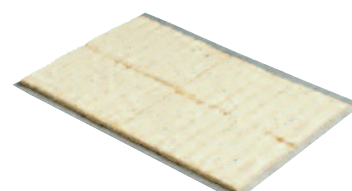
Cheesy Garlic Breadstick Dough